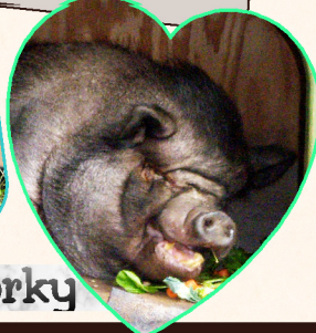
Pumba & Porky