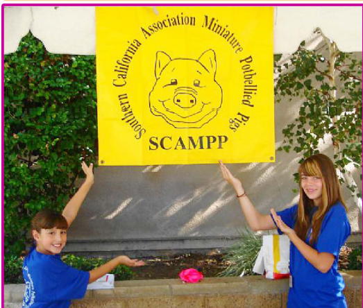
The girls were proud to work the SCAMPP Booth